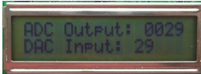
Figure 3.Expected output on LCD

The ADC output register value and VDAC input register value displayed on the LCD should match. Additionally, the VDAC output voltage measured using a multi-meter should be equal to the analog voltage given to the input terminal of the ADC component. The input voltage to the ADC should be within the range (0 – 1.024V). Out of this range causes incorrect result.